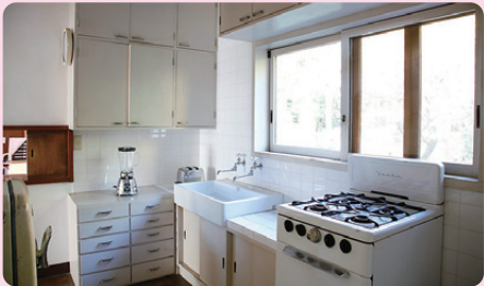
House of Kunio Mayekawa Built : 1942