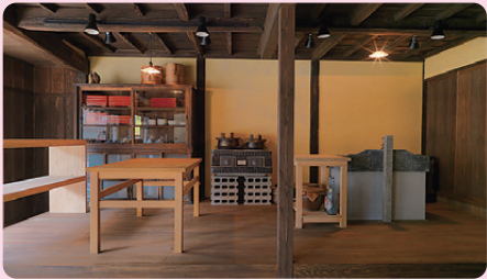
Mantoku Inn Built : End of Edo period to beginning of Meiji period 2