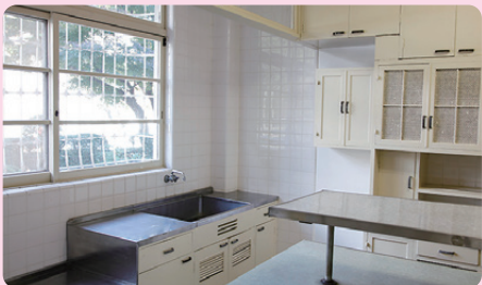
Residence of Hachirouemon Mitsui Built : 1952