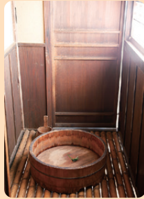
House of the Leader of the Hachioji Guards (Hachioji-sennin-doshin) Built : Late Edo period 4

Most of houses in the Edo-Tokyo Open Air Architectural Museum have baths, but there were also many houses without baths in Japan long time ago. Which bath do you want to use?