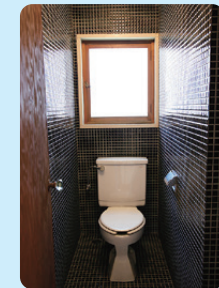
House of Kunio Mayekawa Built : 1942 10