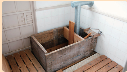
Tokiwadai Photo Studio Built : 1937