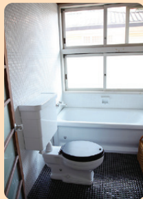
House of Kunio Mayekawa Built : 1942