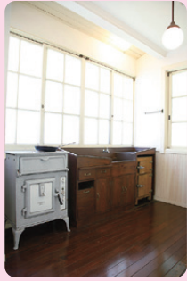
House of Okawa in Den'enchofu Built : 1925 3