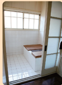
House of Okawa in Den'enchofu Built : 1925 6