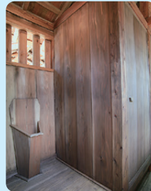
Mantoku Inn Built : End of Edo period to beginning of Meiji period