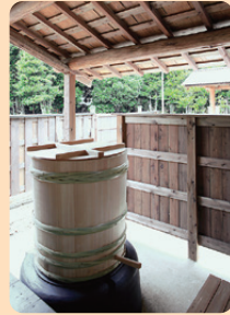
Mantoku Inn Built : End of Edo period to beginning of Meiji period 5