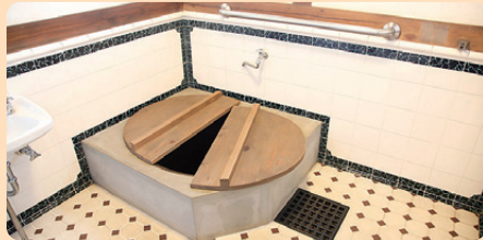
Second House of the Nishikawa Family Built : 1922 7