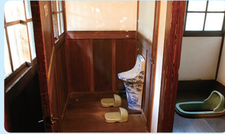
Farmhouse of the Tenmyo Family (Collection of the former Musashino Folklore Museum) Built : Late 18th Century 8

It is said that the toilets in Japan long time ago often were dark and smelled bad. Urine were occasionally stored and used for fertilizer. As houses became equipped with water system, they came to have flush toilets.