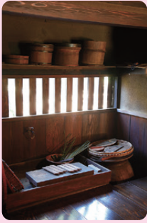
Farmhouse of the Tsunashima Family Built : Mid-Edo period (1603-1867) 1

People in Japan used to do their kitchen works sitting on the floor. They later came to use washstands so as they can do their works standing.